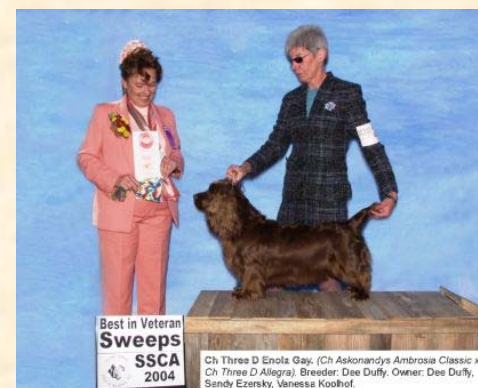
Best in Veterans Sweeps

2004 Sussex National Specialty Río Rancho, New Mexico October 8, 2004