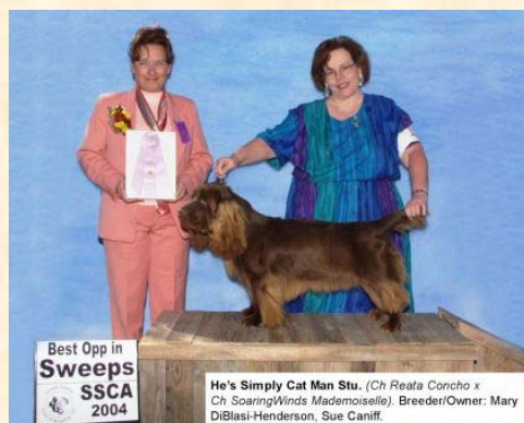
Best of Opposite in Sweeps