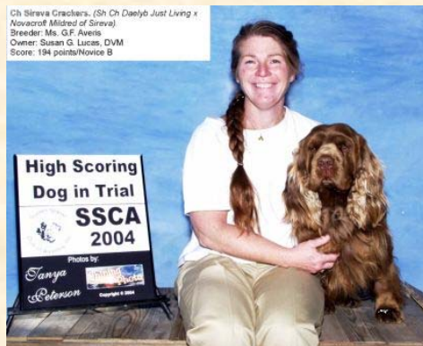
High in Trial