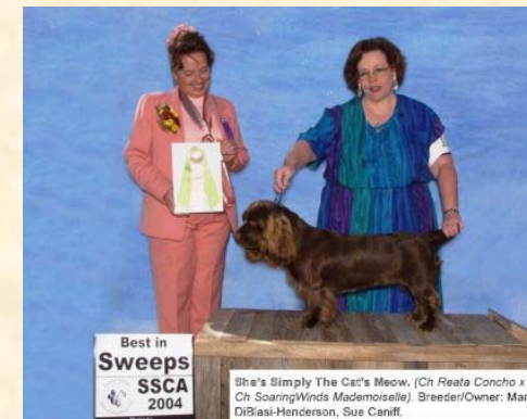
Best in Sweeps